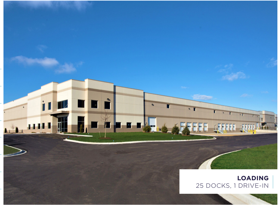
LOADING 25 DOCKS, 1 DRIVE-IN