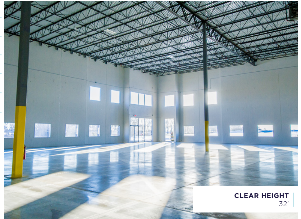
CLEAR HEIGHT 32'