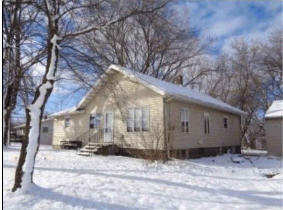
Total living area is 1,286 SF; building assessed value is $159,300