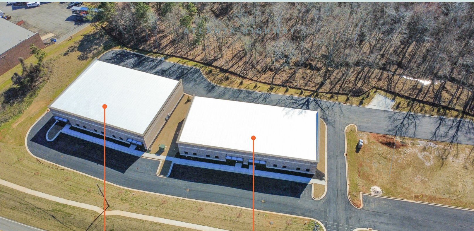
Bldg. 100 12,000 RSF Construction Complete