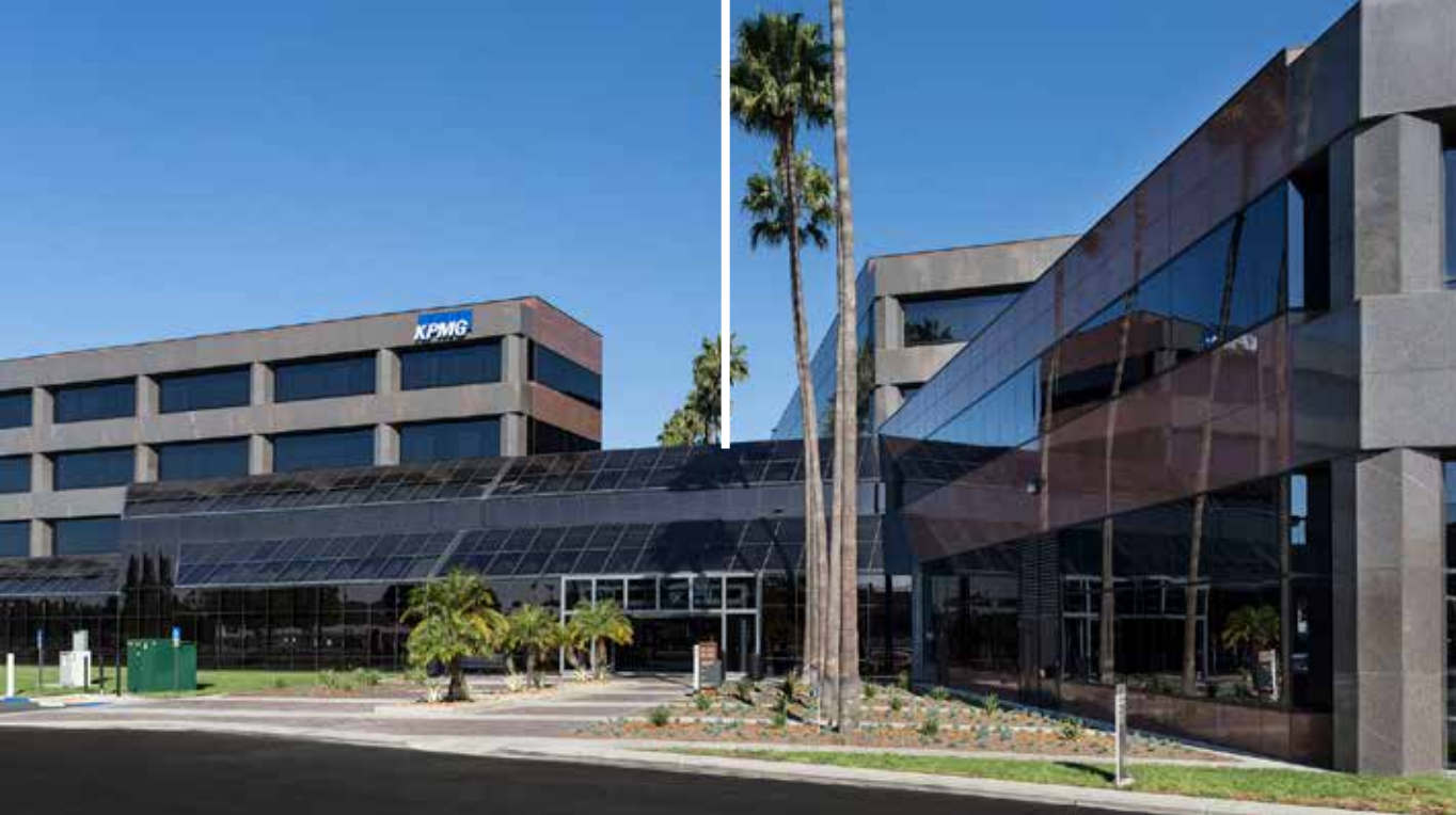
NEW LOGO, NAME AND SIGNAGE