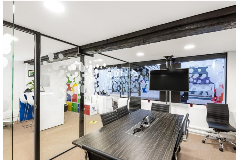
The photographs show furniture that has now been removed