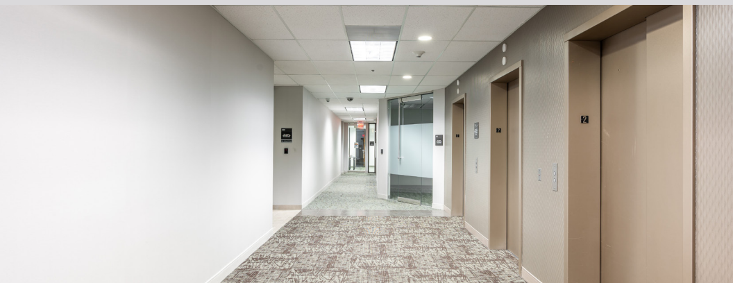
Greenway Plaza III