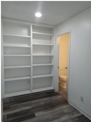
[Plenty of space, bathroom & shower.]