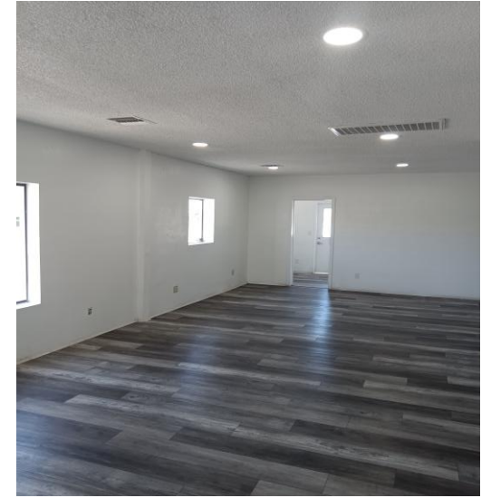
[Office space leading to back door]

Schedule a showing now before this huge & fabulous space is gone! This is a great spot for a growing & prosperous business future.