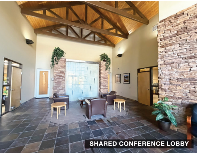
SHARED CONFERENCE LOBBY