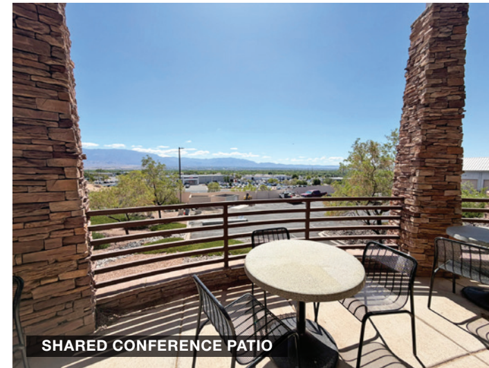
SHARED CONFERENCE PATIO