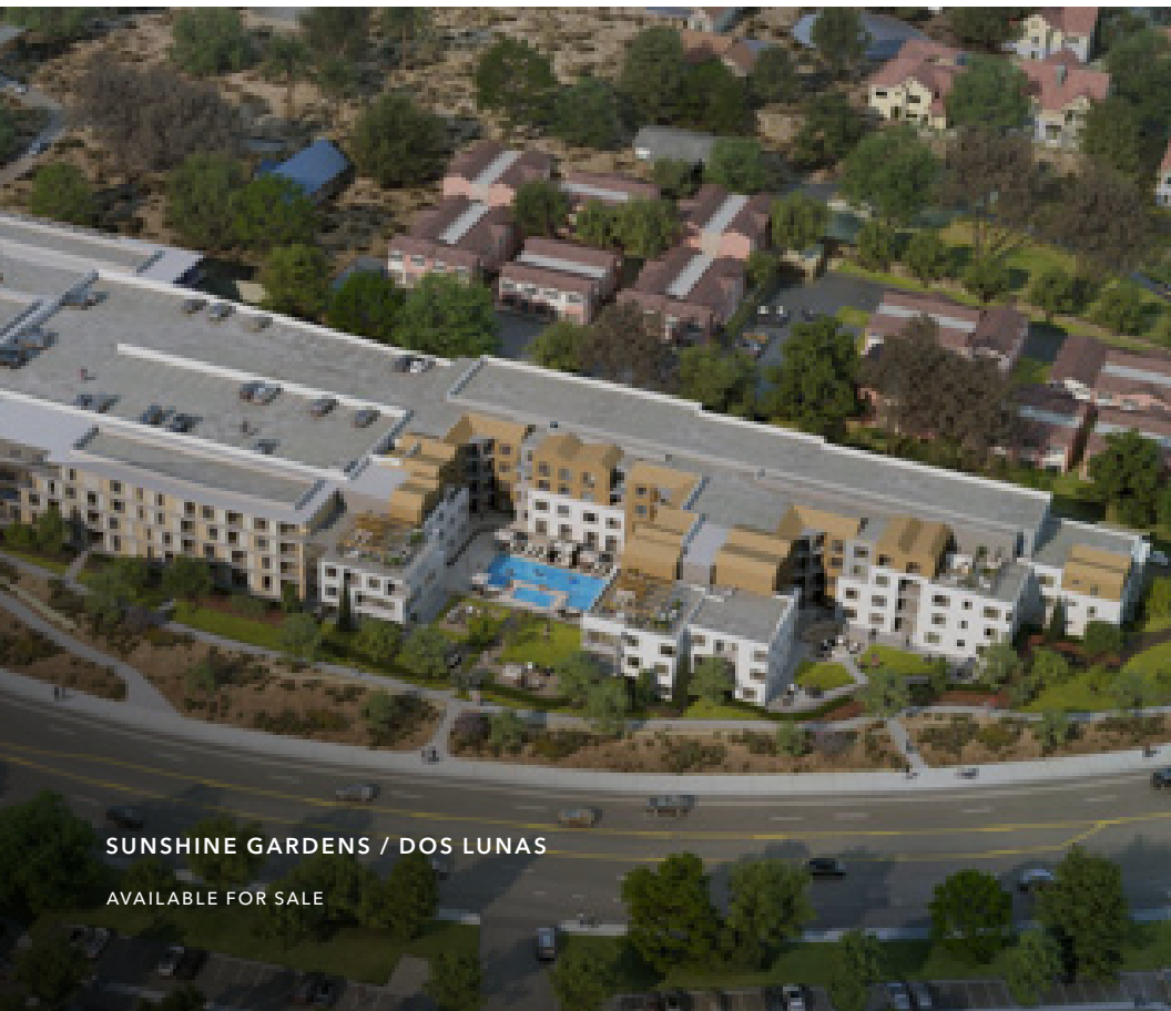
SUNSHINE GARDENS / DOS LUNAS