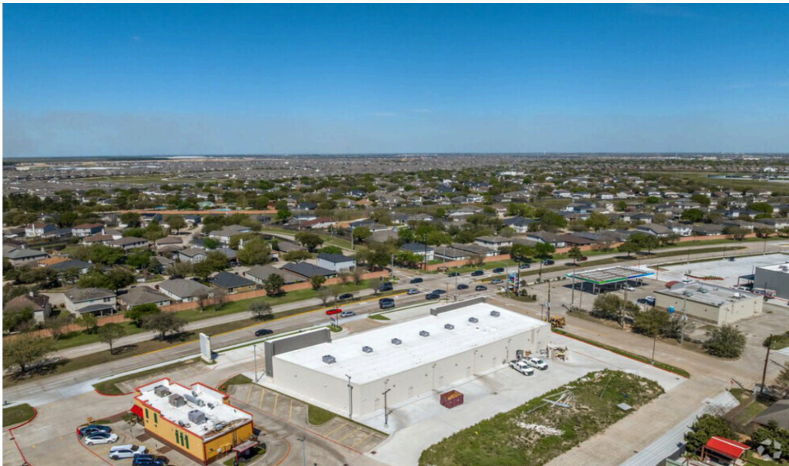
High Visibility to Over 30,000 VPD