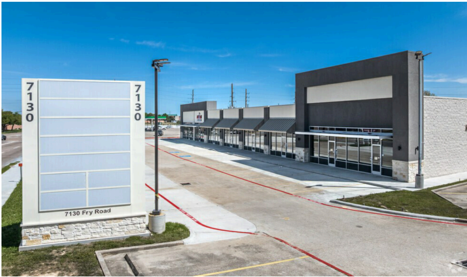
Signage at the Entrance