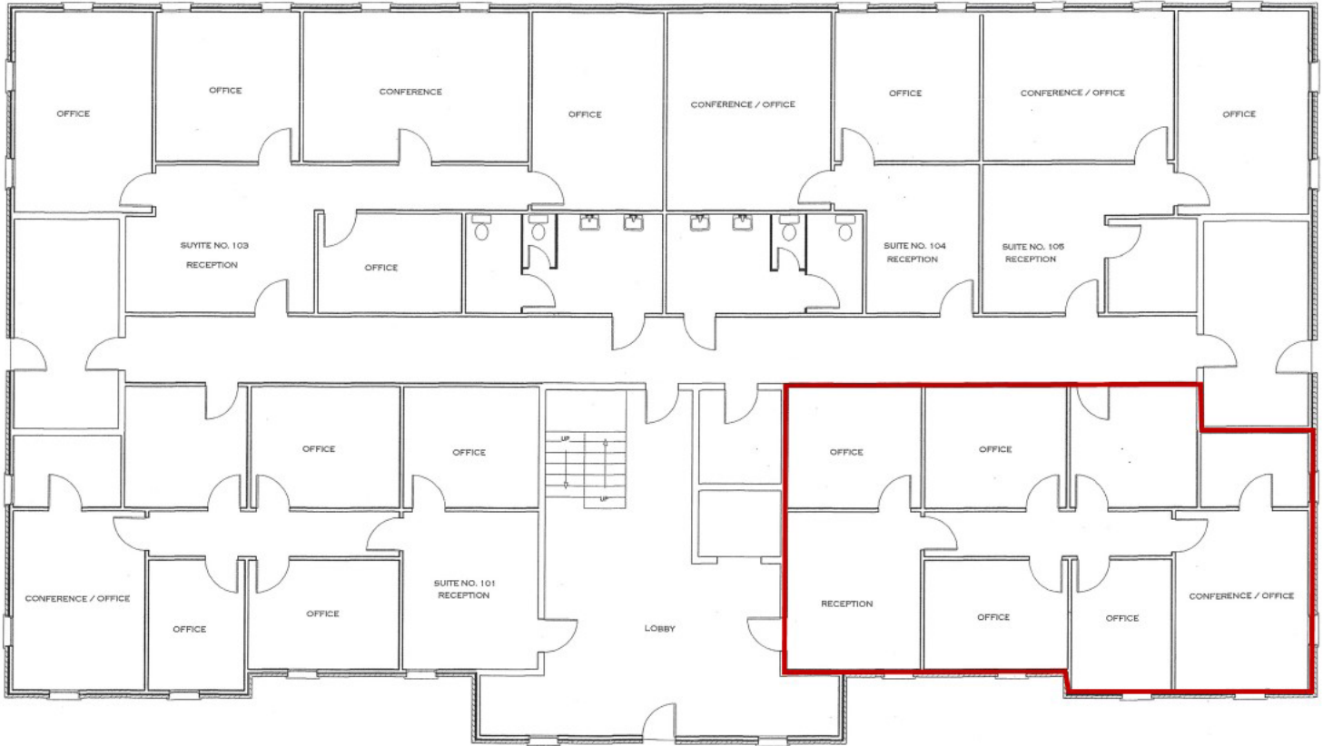
FIRST FLOOR LAYOUT PLAN