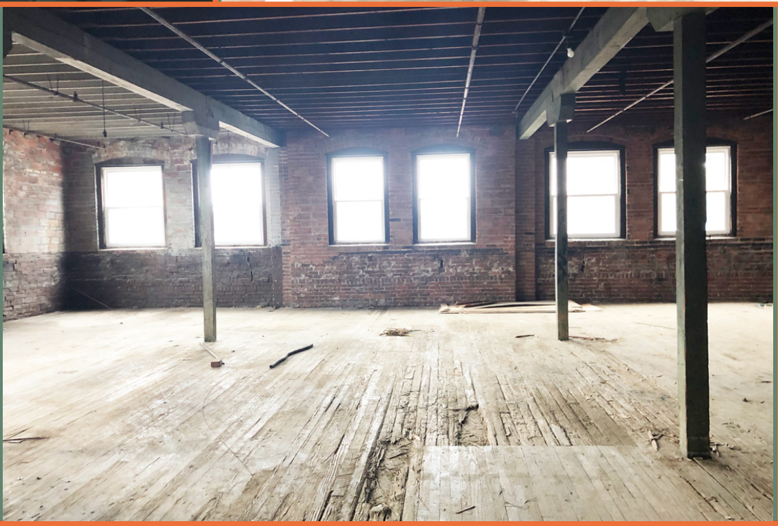
Third Floor Looking South