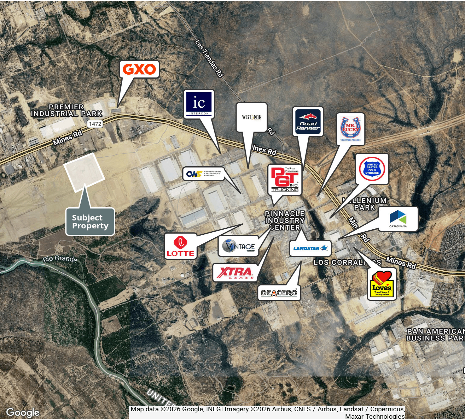
Map data ©2026 Google, INEGI Imagery ©2026 Airbus, CNES / Airbus, Landsat / Copernicus, Maxar Technologies

CARLO MOLANO, SIOR carlom@forumcre.com M: 956.523.9403 O: 956.717.9090