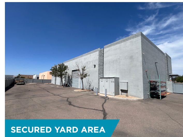
SECURED YARD AREA