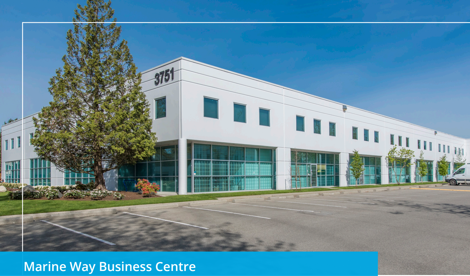
Marine Way Business Centre 3751 North Fraser Way, Burnaby, B.C.