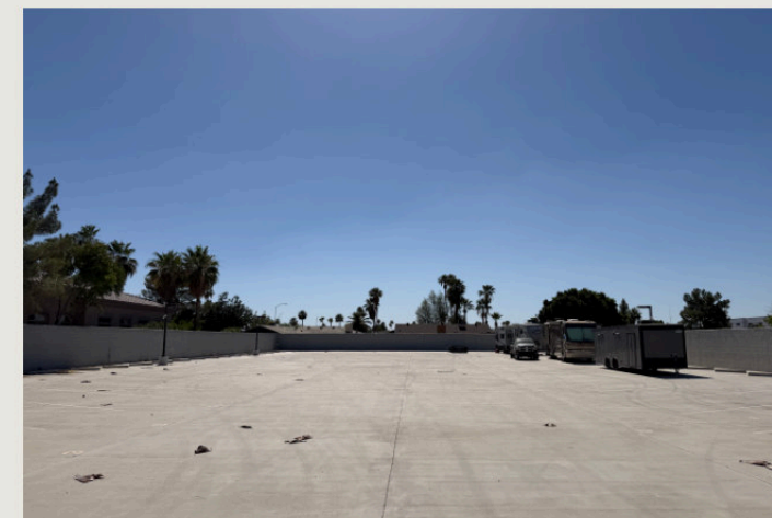
Fig. 01 · Paved yard looking west — 40 striped & outlined stalls