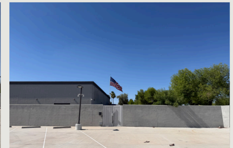
Fig. 02 · 8' CMU wall & side gate