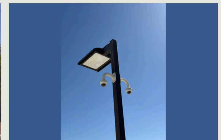
Fig. 04 · Site lighting & security cameras