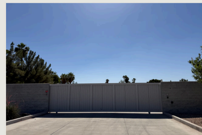
Fig. 03 · Primary motorized access gate