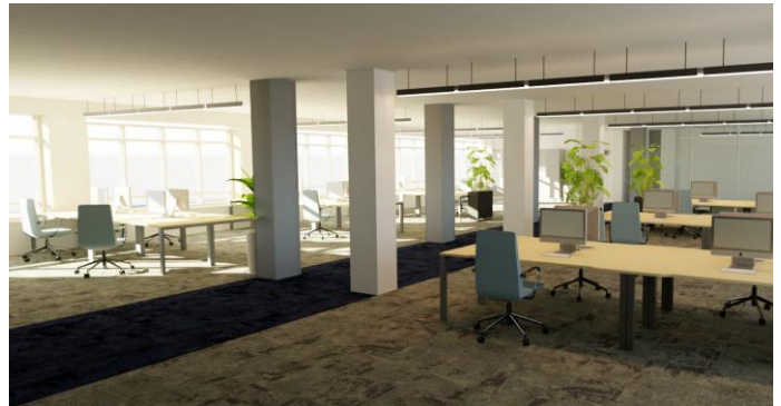
Artists Impression – for illustration purposes only