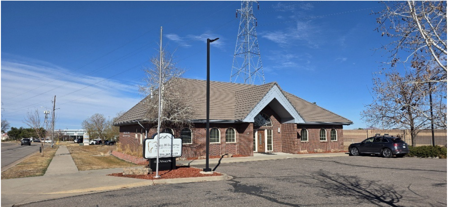
Neighboring building north side of shared parking lot/driveway