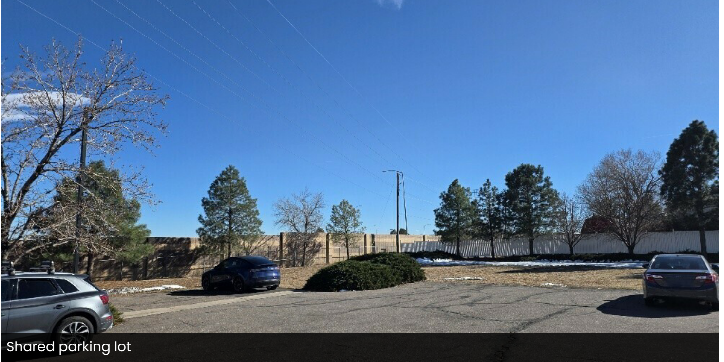
Shared parking lot