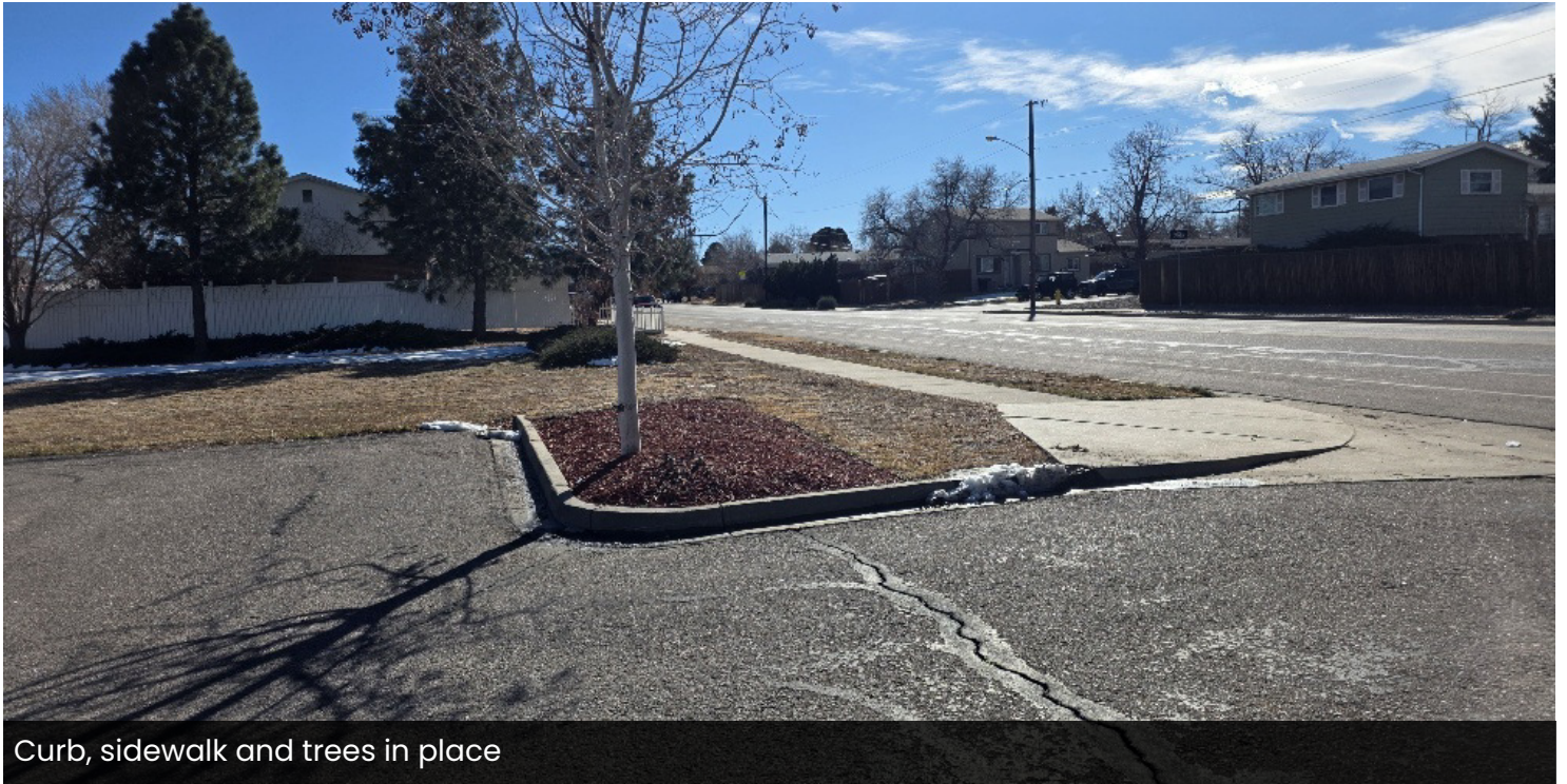
Curb, sidewalk and trees in place