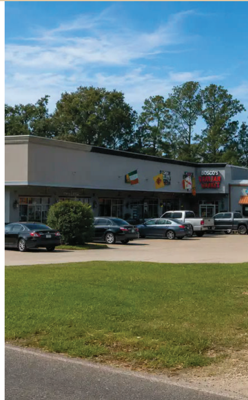
HIGHWAY 59 RETAIL SPACE

Listing notes 3 months rent free on a 3-year term or 5 months free on a 5-year term.