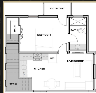
Carriage House Above Garage 2ND FLOOR ADU at 552 SF