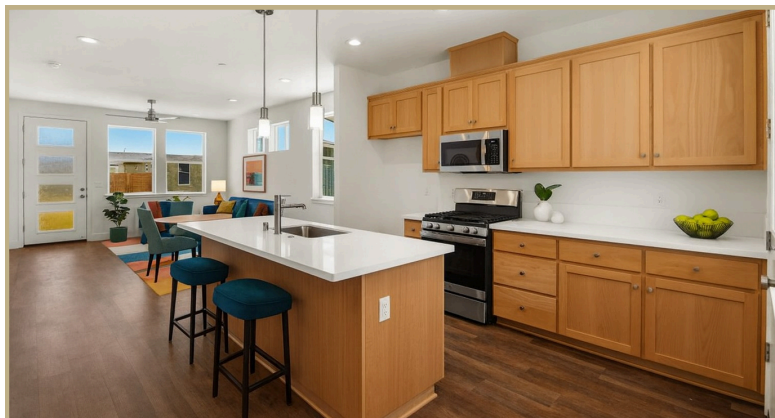
*Representation of Interior of 2br/2ba - finishes may vary