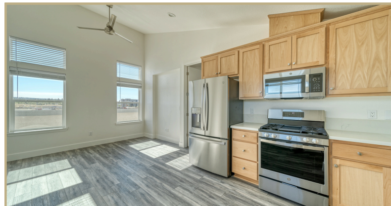
*Actual ADU Interior