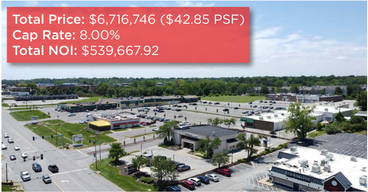
4420-4486 S Noland Road

Total Price: $6,716,746 ($42.85 PSF) Cap Rate: 8.00% Total NOI: $539,667.92