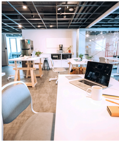
Flexible Workspace Options

Rosemont Executive Suites is more than a workspace – it's a curated environment designed for modern professionals who value elegance, efficiency, and an elevated daily experience. Every detail has been intentionally crafted to inspire focus, foster connection, and support your success.