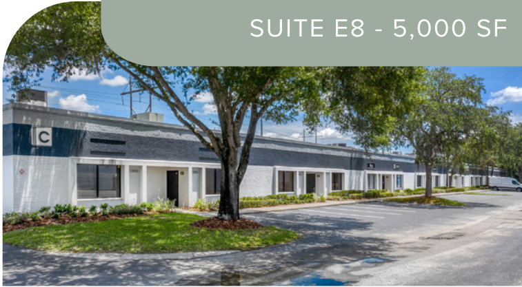
SUITE E8 - 5,000 SF