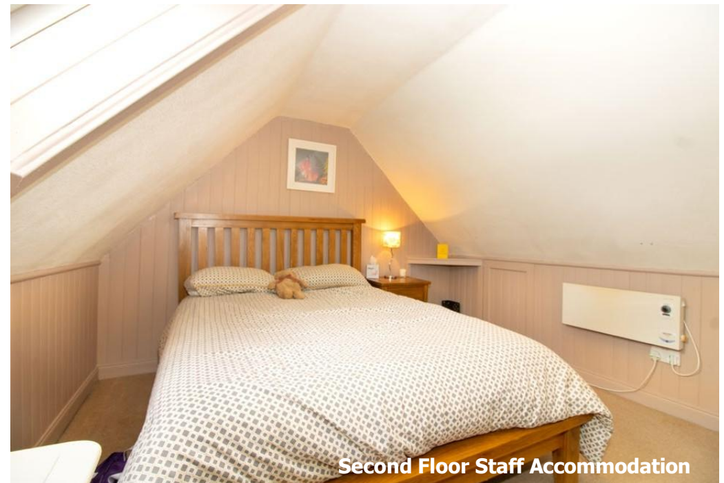
Second Floor Staff Accommodation