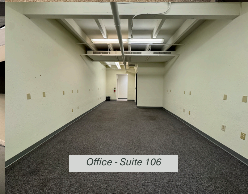
Office - Suite 106