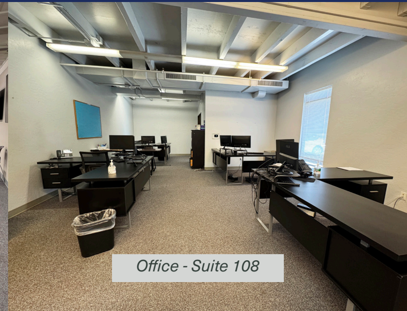
Office - Suite 108