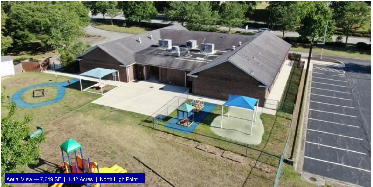
Aerial View — 7,649 SF | 1.42 Acres | North High Point