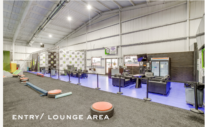
ENTRY/ LOUNGE AREA