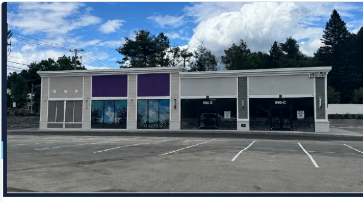
OUTPARCEL BUILDING · UP TO 2,500 SF, DIVISIBLE TO ~1,000 SF