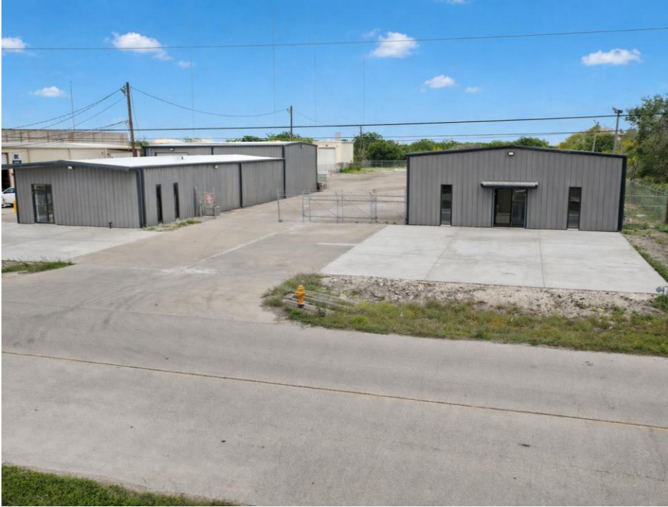
Flato Rd Frontage