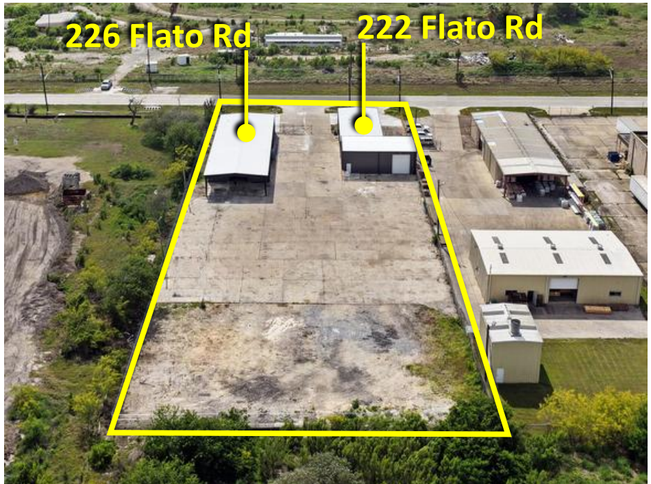
Rear Yard Aerial