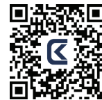
3D MATTERPORT TOUR