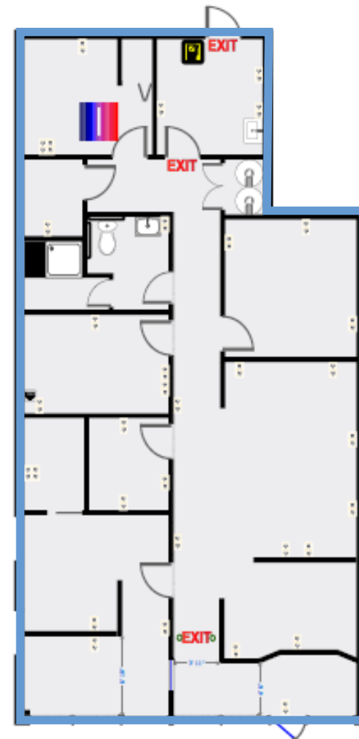
Endcap 1,637 SF