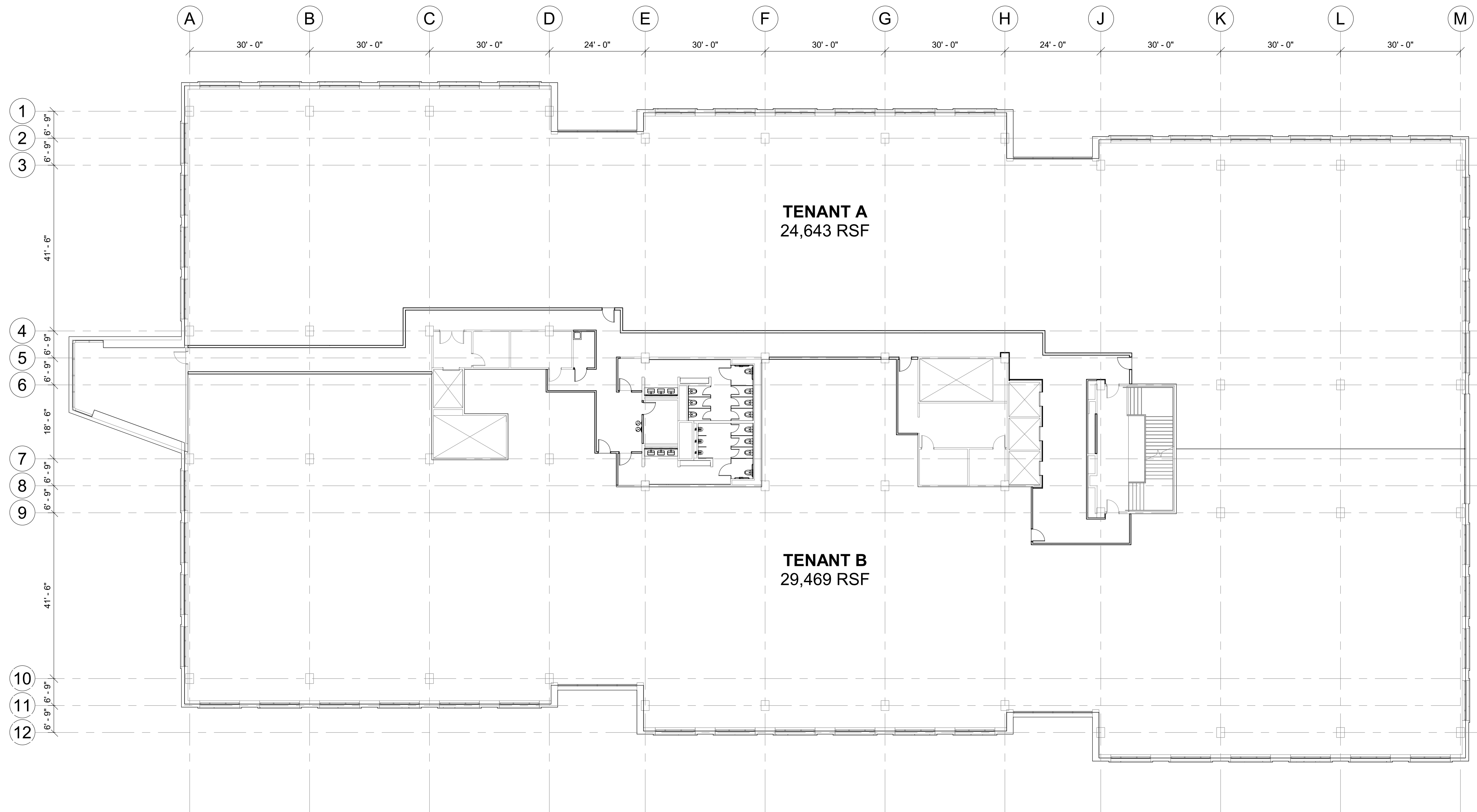
1 TYP FLOOR - LAYOUT A 1/16" = 1'-0"

DELINEATOR LANDSCAPE ARCHITECT 3525 CEDAR SPRINGS RD, SUITE 105 DALLAS, TEXAS 75219