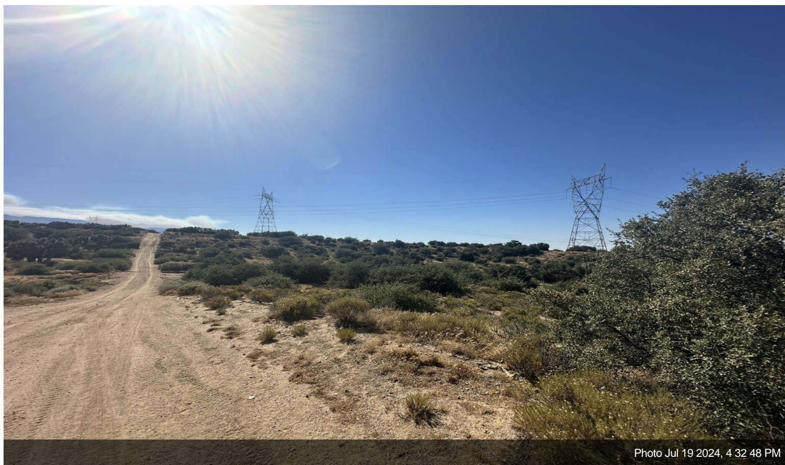
Photo Jul 19 2024, 4 32 48 PM