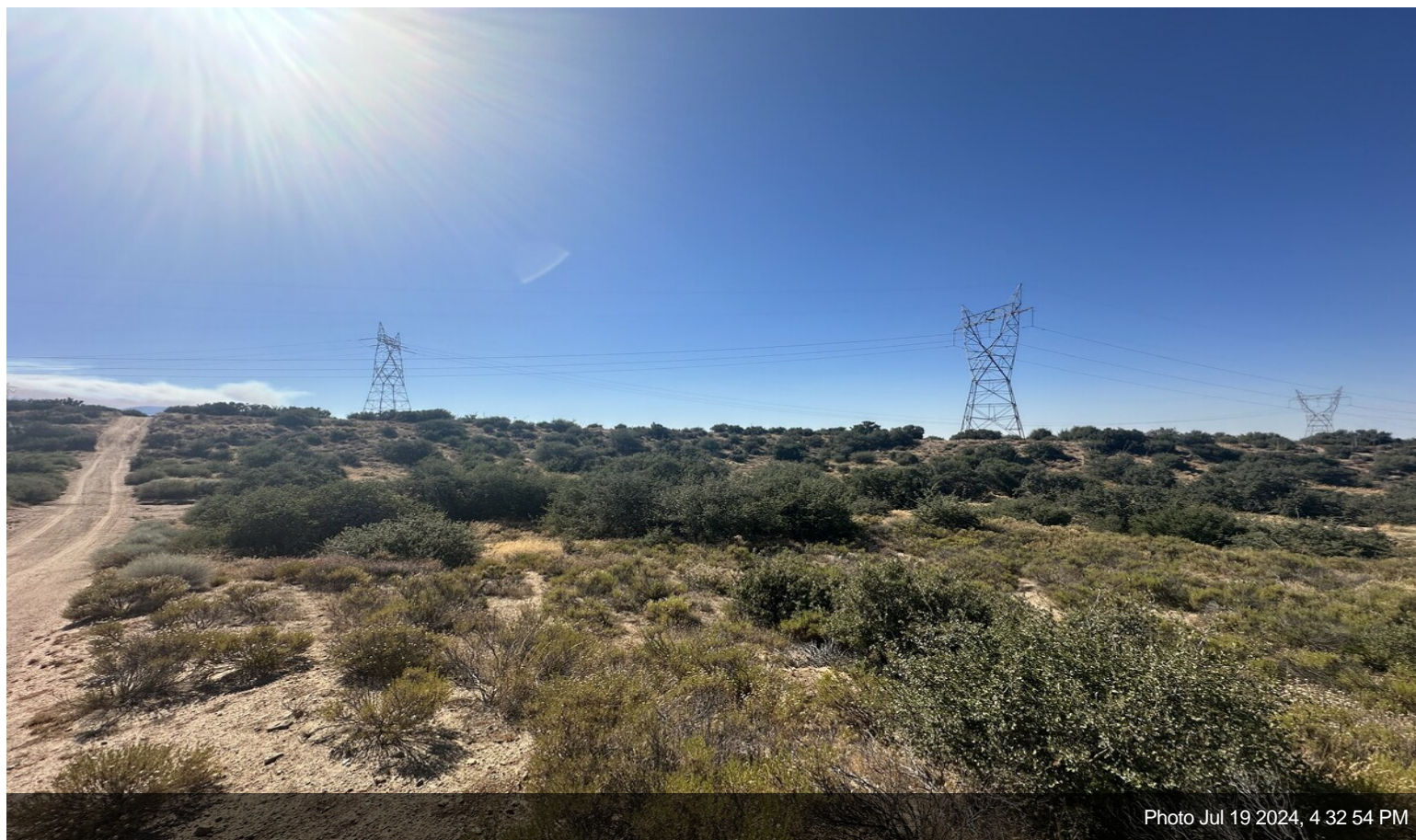
Photo Jul 19 2024, 4 32 54 PM