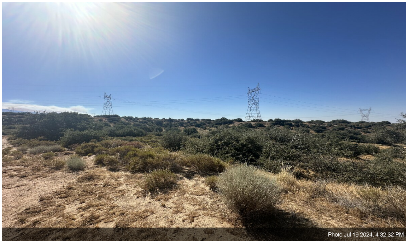
Photo Jul 19 2024, 4 32 32 PM