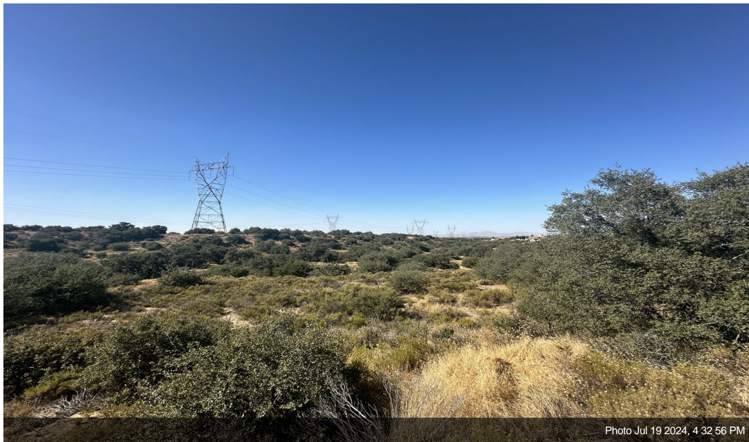
Photo Jul 19 2024, 4 32 56 PM