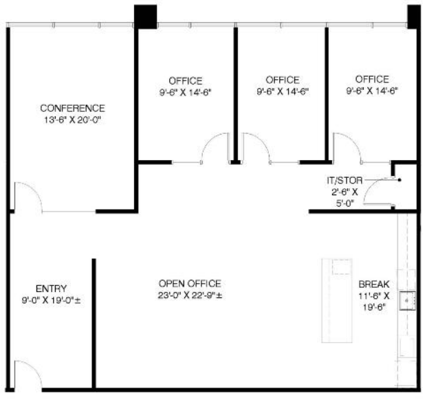
SUITE 2270 - 2,237 RSF