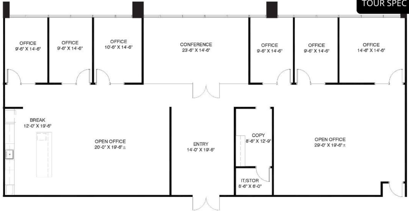
SUITE 2200 - 4,467 RSF