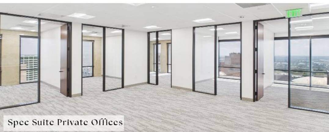
Spec Suite Private Offices