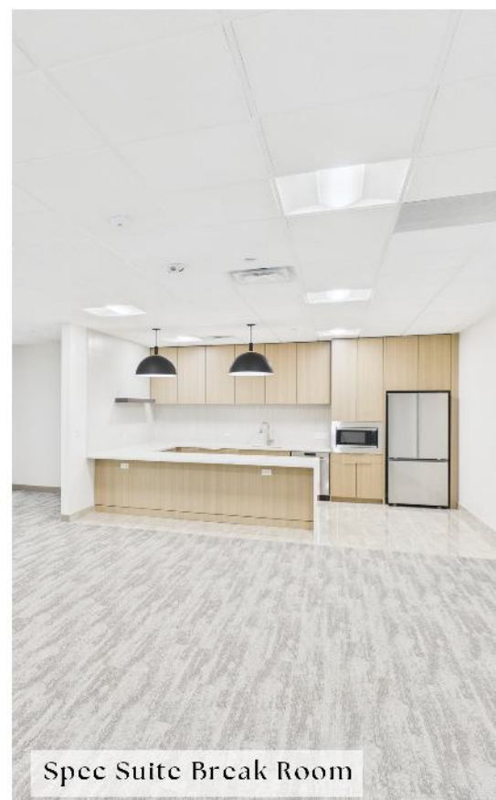
Spec Suite Break Room