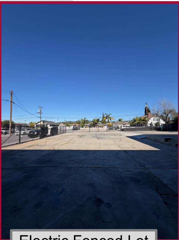
Electric Fenced Lot