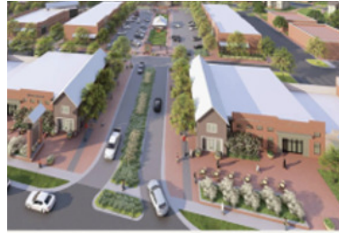
Emerson Park Waxhaw, NC