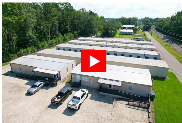
Drone Video: Value Storage Units of Hammond 1