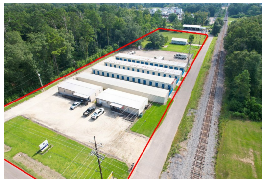
Value Storage Units of Hammond 1