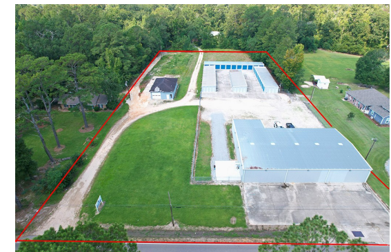
Value Storage Units of Hammond 2