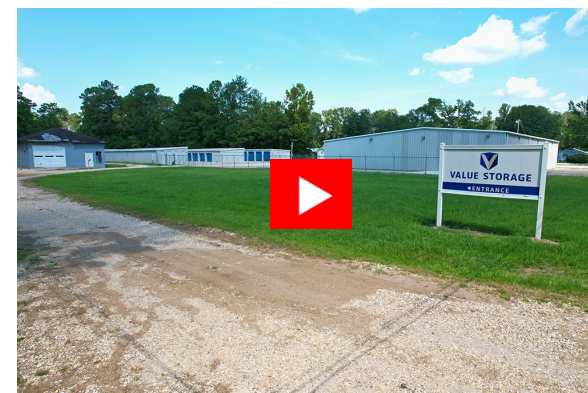
Drone Video: Value Storage Units of Hammond 2