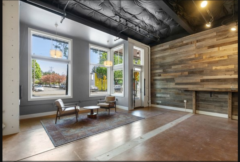
Unit A — Street-Facing Entry & Lounge