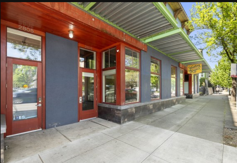
Exterior — Dual Entrances