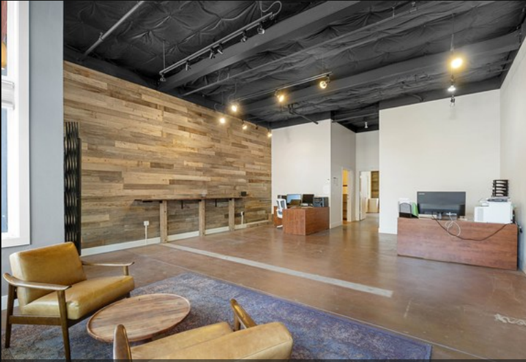
Unit A — Main Open Workspace