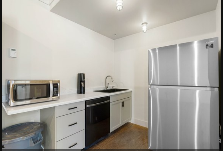
Unit B — Kitchenette