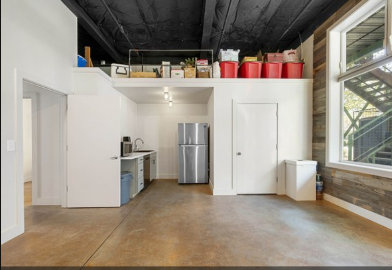
Unit B — Rear Unit & Loft Storage