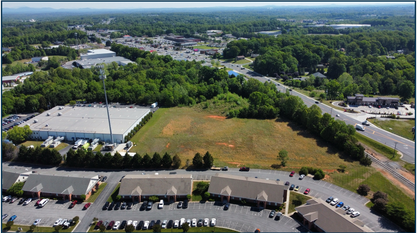
Overhead aerial of the pad site with the adjacent industrial building and commercial corridor.

140 Vista Centre Drive | Forest, VA 24551