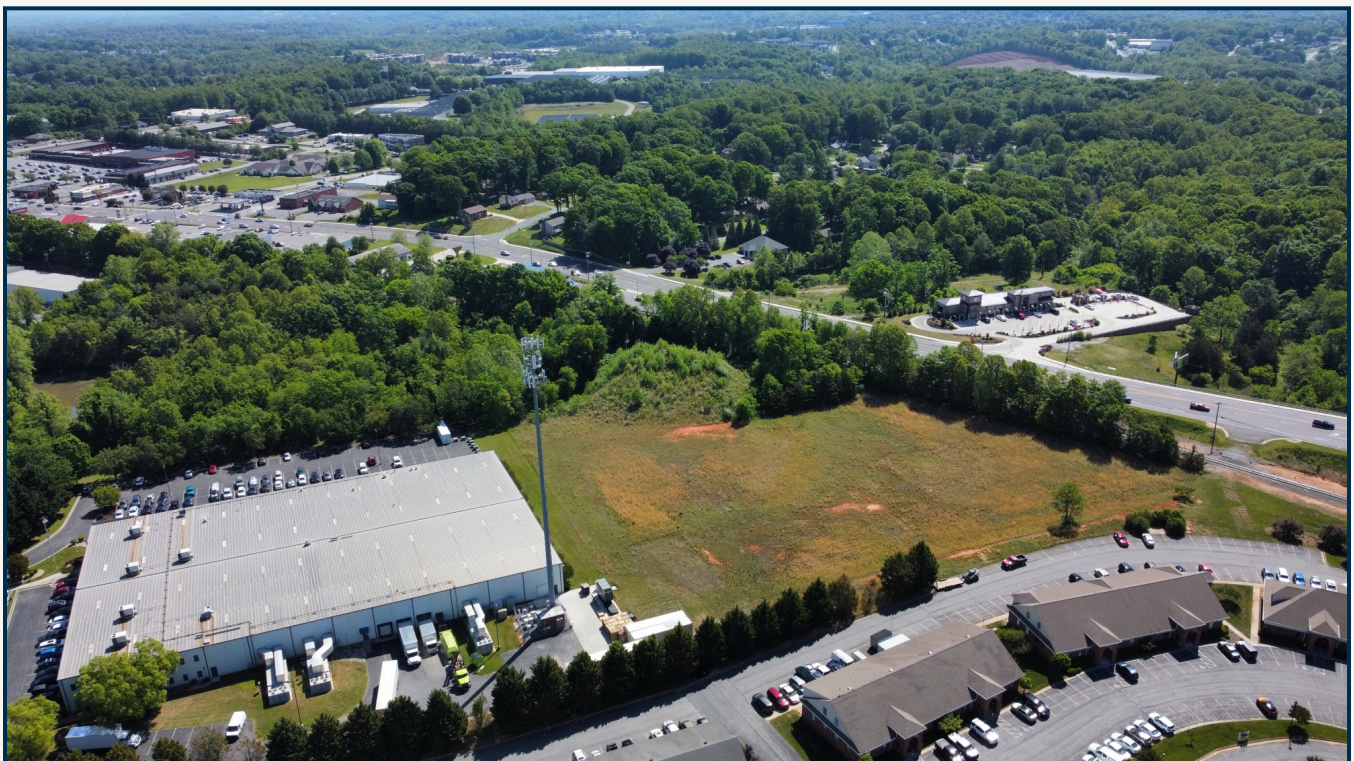
Aerial perspective of the site and surrounding industrial and commercial context.