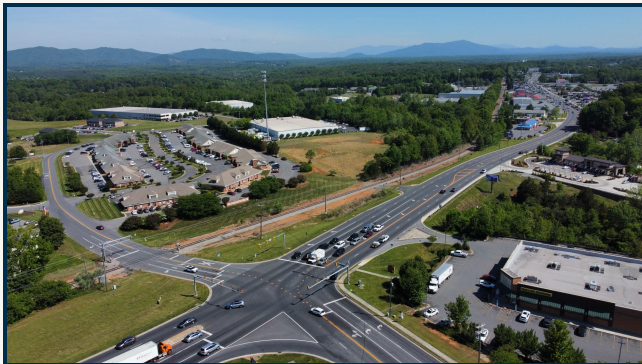
Signalized intersection at US Route 460 — direct site access and traffic corridor.

Lynchburg's economy is thriving, supported by a growing population and rising income levels that help drive an $8.74 billion regional economy. Manufacturing and machining industries are central to the economy, with retailers earning $1.6 billion in annual sales. Lynchburg is home to several major institutions of higher education, including Liberty University (one of the world's largest), contributing to a skilled and diverse workforce pipeline.