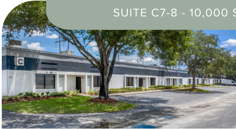
SUITE C7-8 - 10,000 SF

12924-12928 DUPONT CIR, SUITE C7-8 | TAMPA, FL 33626