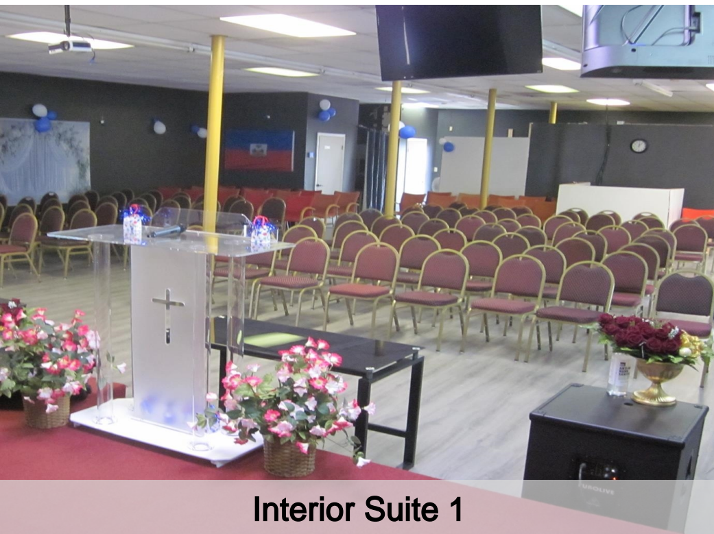
Interior Suite 1