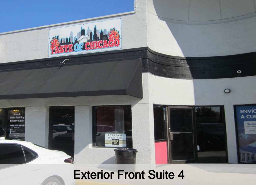
Exterior Front Suite 4