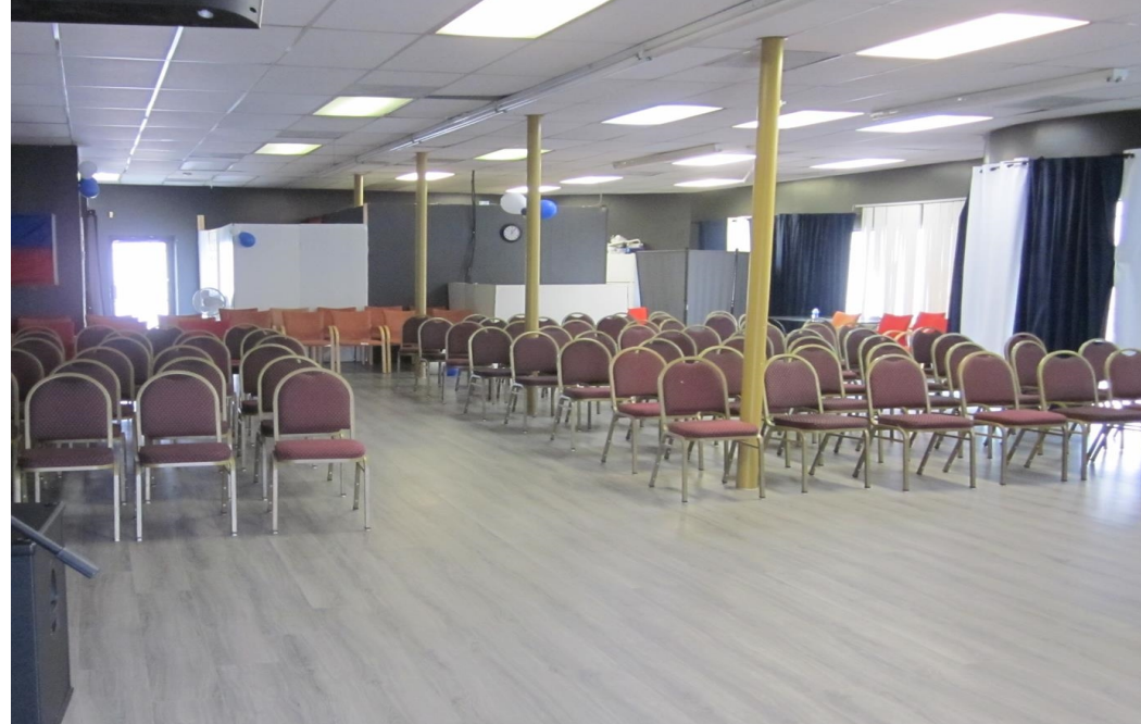
Interior Suite 1