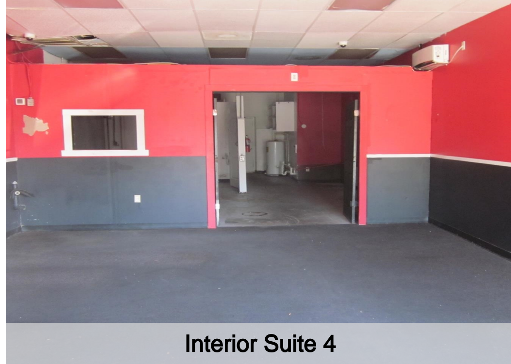
Interior Suite 4