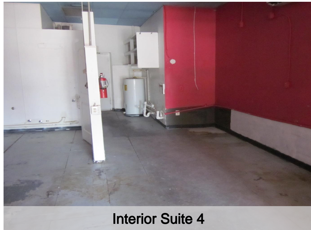
Interior Suite 4