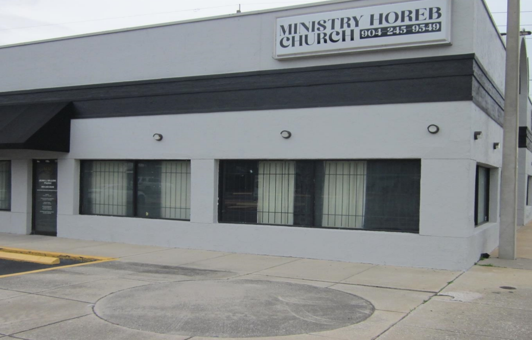
Exterior Front Suite 1