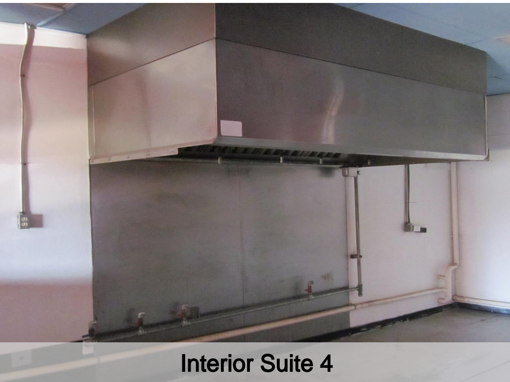
Interior Suite 4