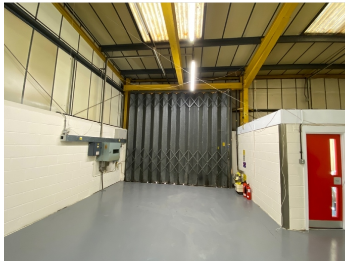
Internal- Front manual loading door