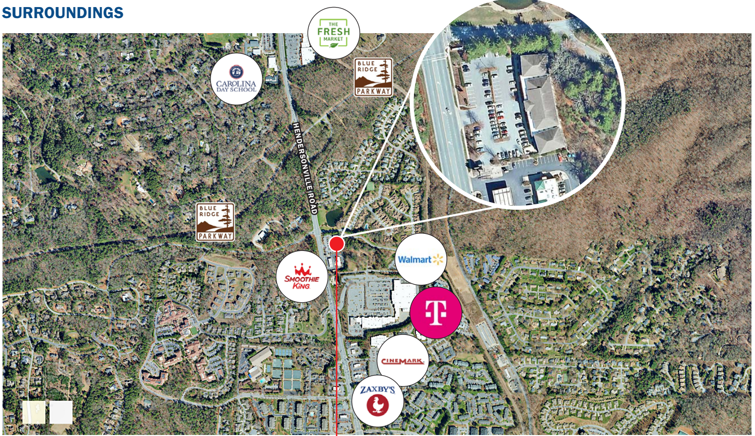
MAP CREDIT: NOAA