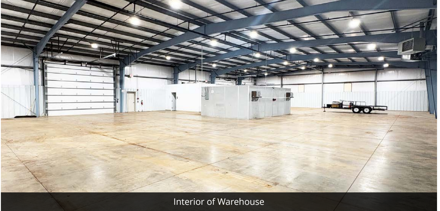
Interior of Warehouse