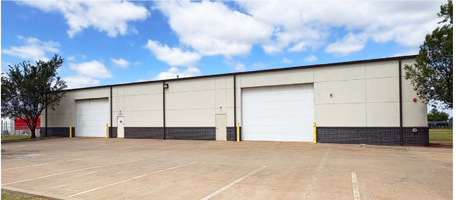
Exterior Photo of Warehouse