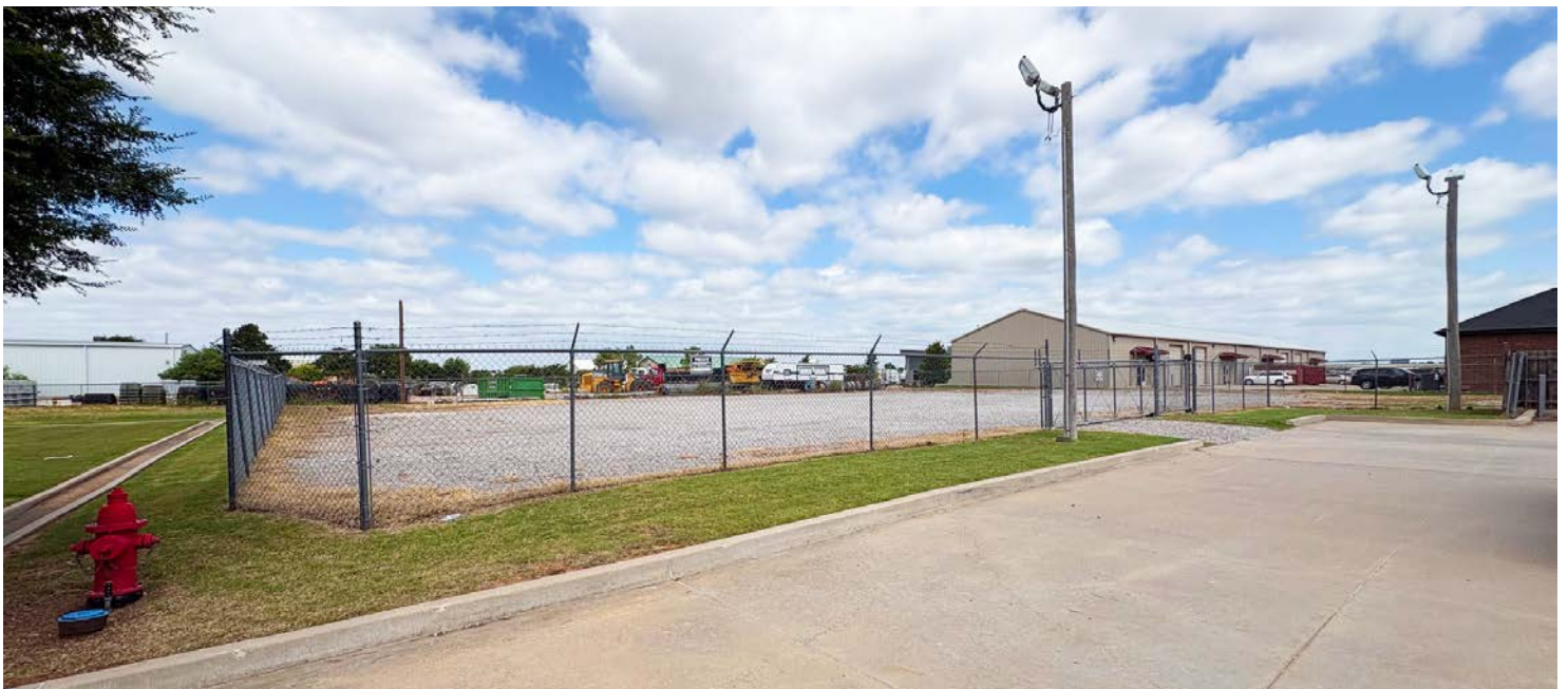
Exterior Photo of Secured Yard