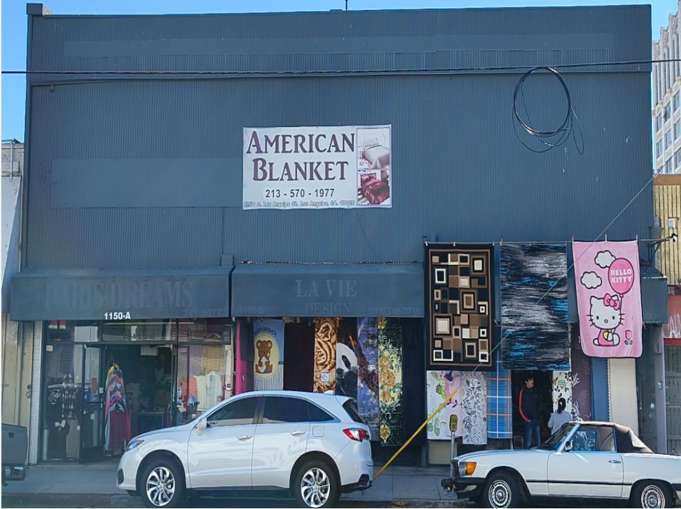
1150 S. Los Angeles St.