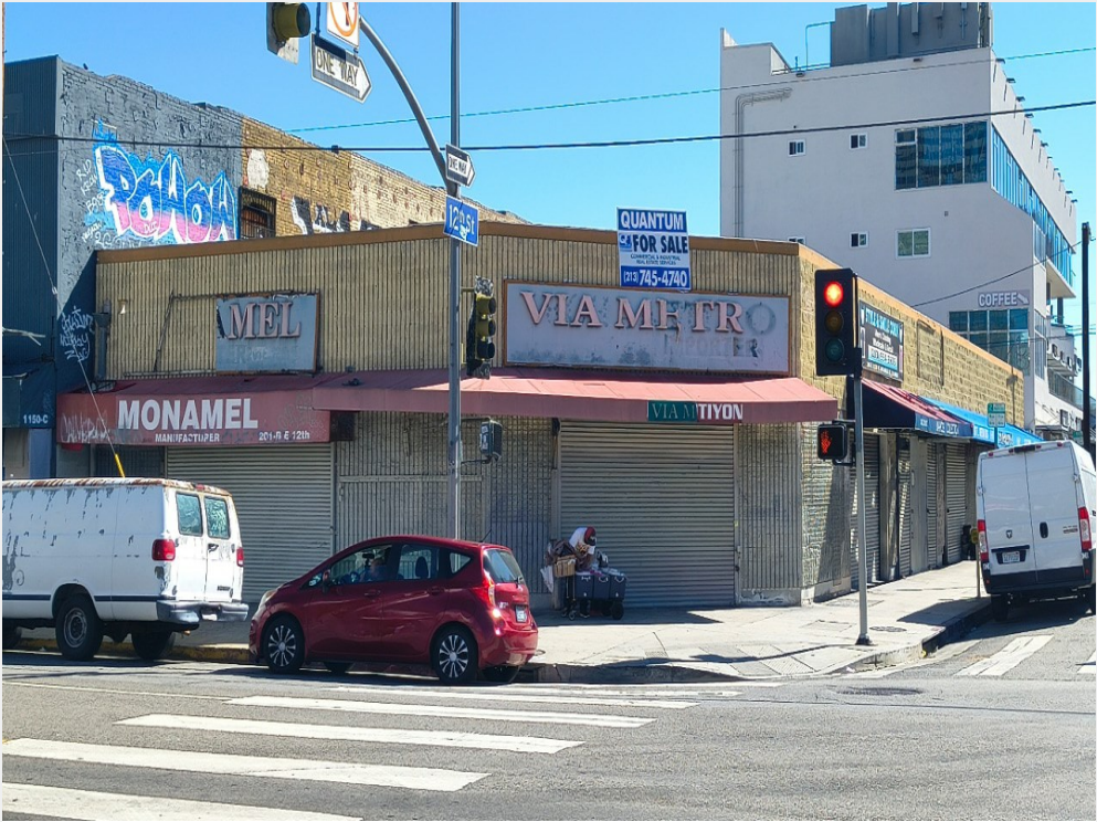
Corner Building 201 E. 12th St.