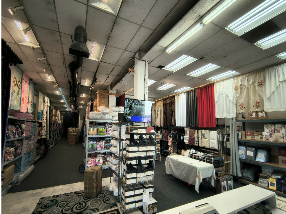
Interior Store 1150 S. Los Angeles St.