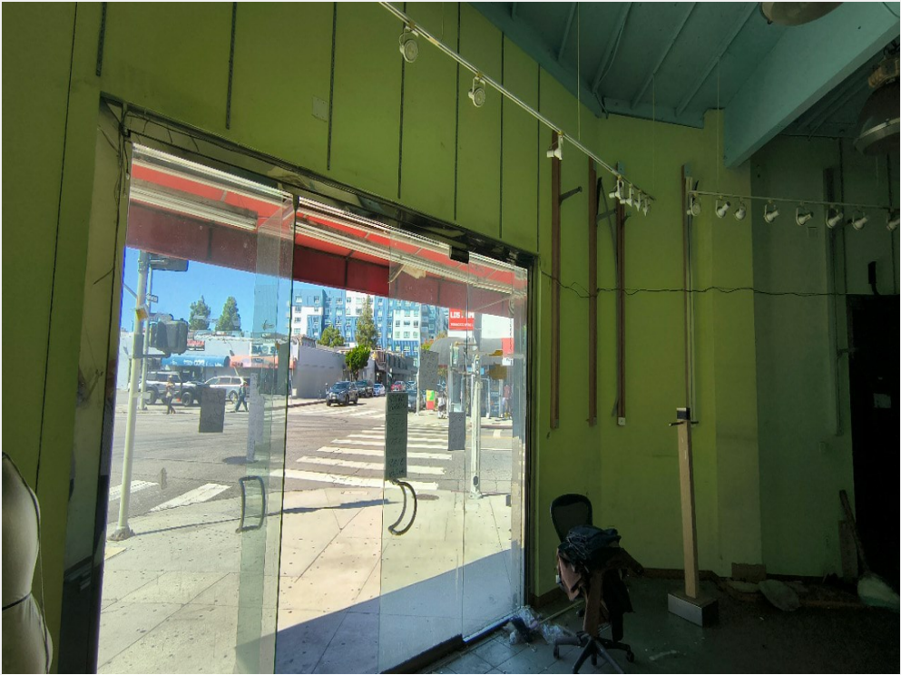
Interior of Corner Unit