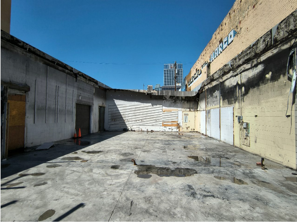
Fire Damaged Portion of Corner Building