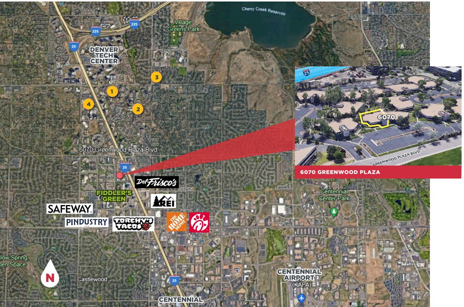
6070 GREENWOOD PLAZA

Within 1.5 Miles: 100+ Restaurants & Bars 12+ Hotels & Lodging 100+ Banking Institutions