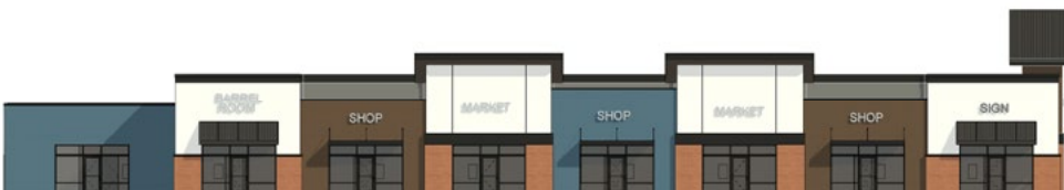
Building A - East & North Elevations