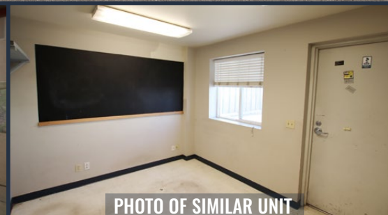
PHOTO OF SIMILAR UNIT