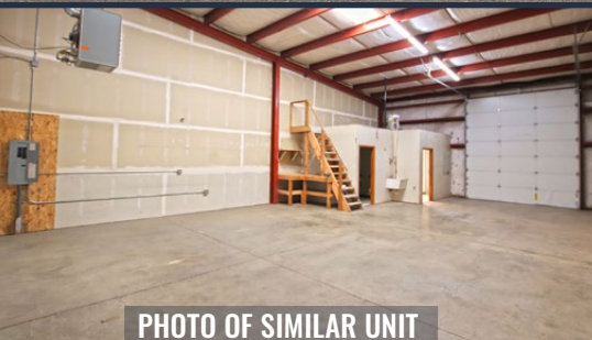
PHOTO OF SIMILAR UNIT