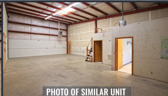
PHOTO OF SIMILAR UNIT