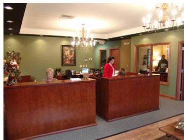
Surgery Center, Centerville, OH