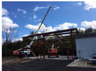
Industrial, Miamisburg, OH