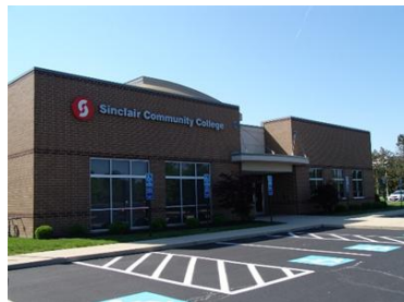
Community College, Mason, OH