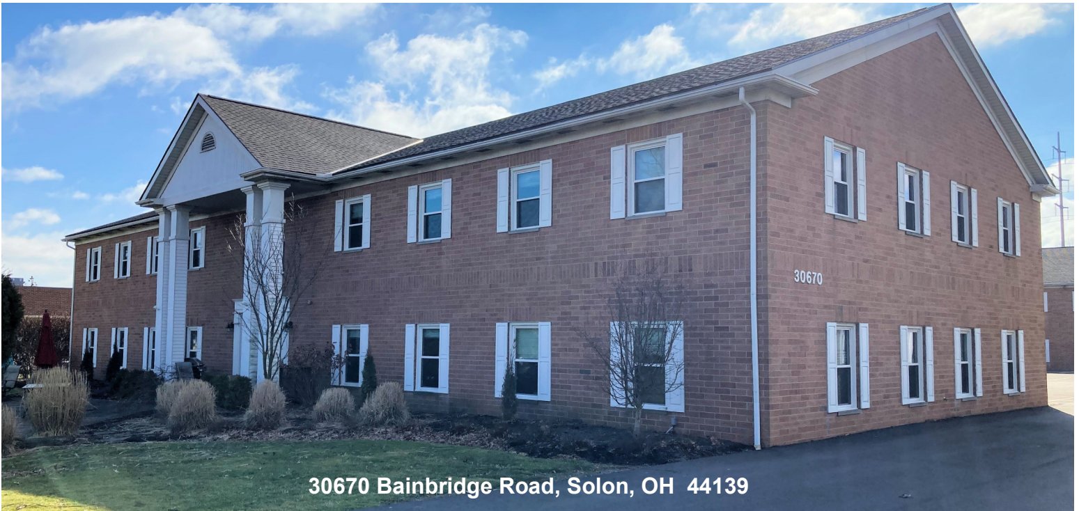
30670 Bainbridge Road, Solon, OH 44139